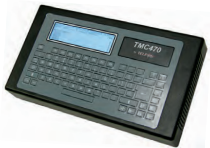
Compact Self-Contained TMC470 Controller — no PC required.