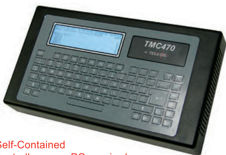
Compact Self-Contained TMC470 Controller — no PC required.